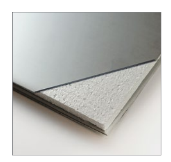
SECTION PANELS Polystryrene insulation available for solid sectional panels.

Rail and stile sections are assembled with through bolts for added strength and longevity.