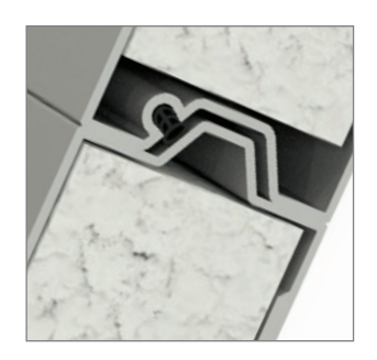
BULB SEAL Integrated bulb seal eliminates air and water infiltration keeping your interiors protected from the unwanted elements.