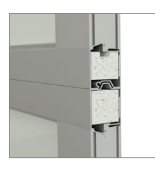
INSULATION Optional insulated section rails are available providing additional thermal protection for your garage space.